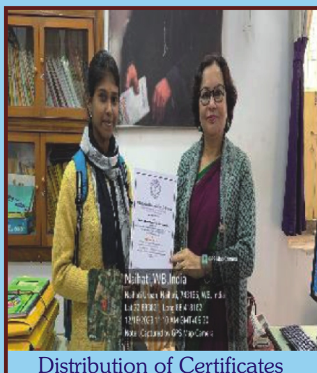
Distribution of Certificates of Add-on Courses